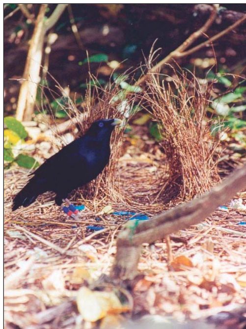
Showing off the bling bling. A male bowerbird decorates for potential mates.

Virginia Morell is a writer in Ashland, Oregon.