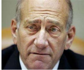
Israeli report on war criticizes Olmert 📷