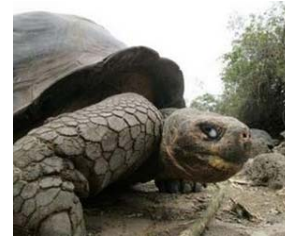
Tourism endangers Galapagos ecosystem 📷