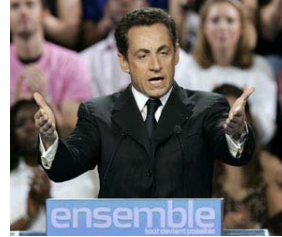
Poll: Sarkozy to win French presidential elections run-off 📷