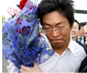
Seven released Chinese workers arrive in Ethiopian capital 📷