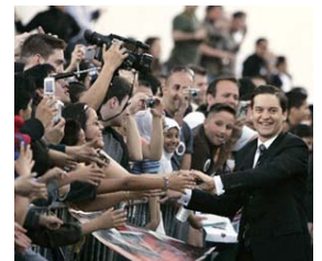
Spider-Man 3 premieres in New York 📷