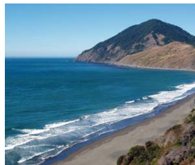
Neurotoxin kills more marine mammals