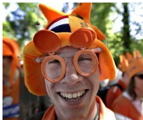
Netherlands celebrates Queen's Day 📷